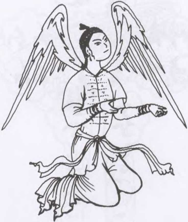
Fig. G. after detail from ms. Haft Awrang of Ğamī, Iran 1556-65, FGA 46.12 fol.188a; M Shreve Simpson op.cit.