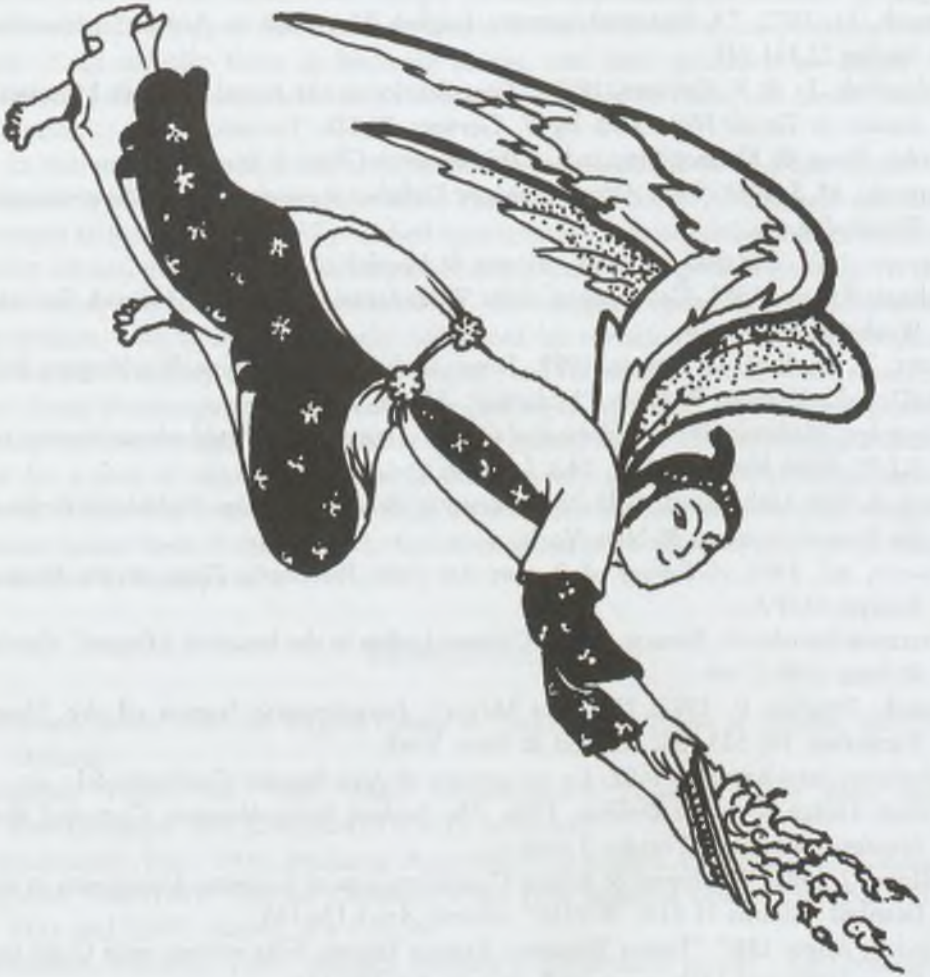
Fig. A. after detail from 'The Gnostic has a vision of angels...' Haft Awrang of Ğāmī, Iran 1556-65, FGA, inv. 66.12, fol. 147a; M. Shreve Simpson, Sultan Ibrahim Mirza's Haft Awrang ., FGA 1997, p.148.