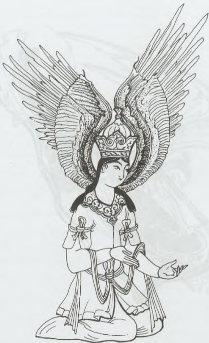
Fig. C. after detail from 'Muhammad & Ğibril' Siyar-i Nabî , Ottoman 1594-5, TSM, Istanbul, H.1223, fol. 296a; Zeren Tanındı, Siyer-i Nebî , Istanbul 1984