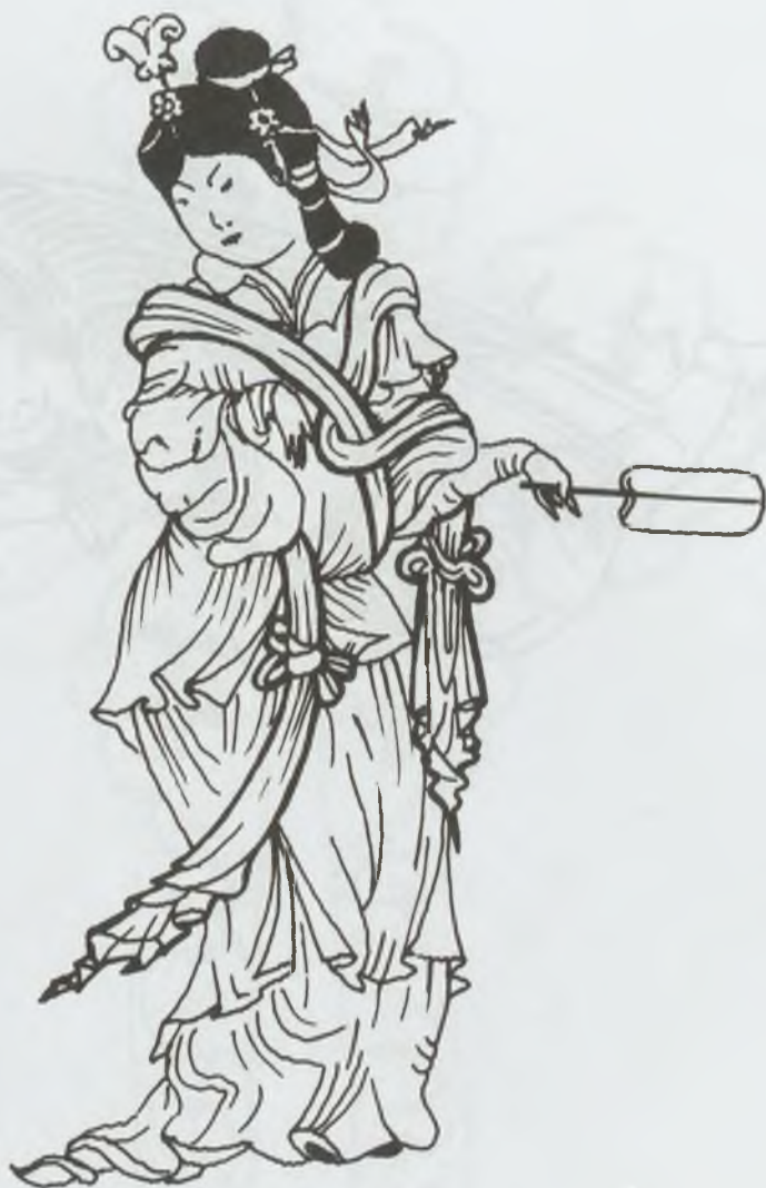
Fig. D. after TSM, Istanbul, H.2153 fol.170r; Islamic Art 1 (1981)