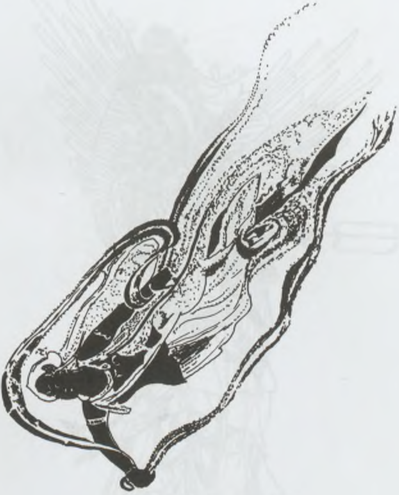
Fig. B. after detail from Cave 321, early Tang period, Dunhuang; R. Whitfield & S. Otsuka, Dunhuang, caves of the singing sands , London 1995, pl.92