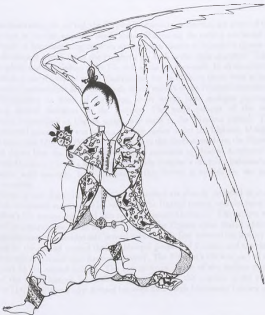
Fig. H. after A. Souvadar Art of the Persian Courts , New York, 1992, item 101.