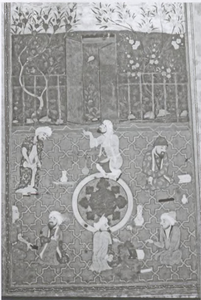
4. A frontispiece to Qışaṣ al-anbiyā' , Istanbul, Topkapı Sarayı Müzesi, H. 1226.