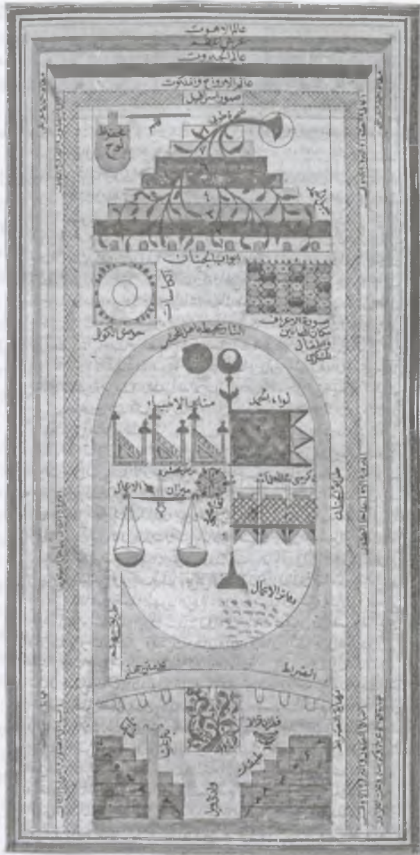
1. The topography of the Day of Judgement, London, the British Library., Or. 12964, fol. 23b.