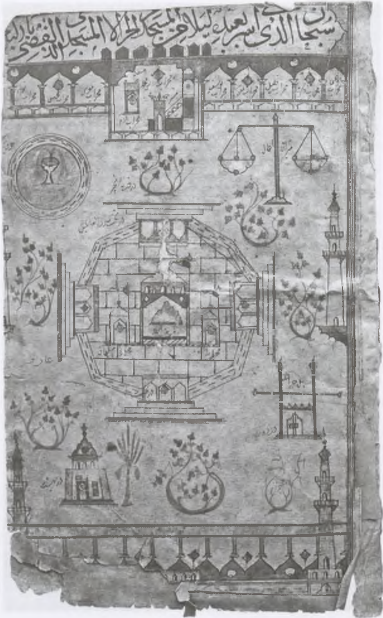
3. Al-Haram al-Sharif in Jerusalem, Haifa, The National Maritime Museum, Inv. No. 4576, fol. 49a.