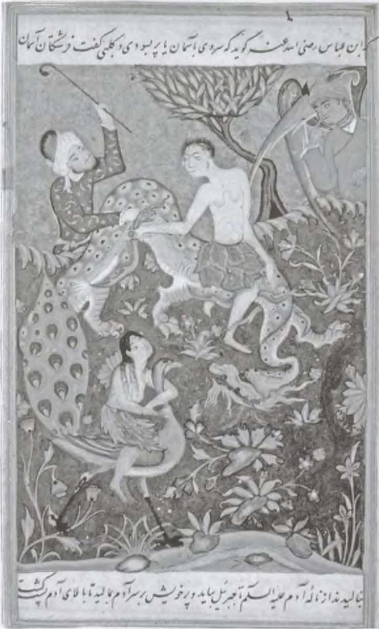
6. Expulsion from Paradise, Istanbul, Topkapi Saray Museum, H. 1225, fol. 14b.